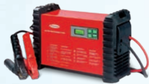
VEHICLE HANDOVER ACCTIVA PROFESSIONAL FLASH 70A