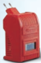
ACCESSORIES ACCTIVA EASY