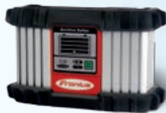
SHOWROOM ACCTIVA SELLER 30A