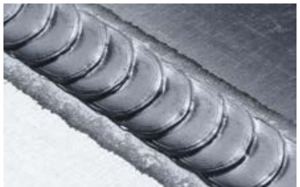
Lap joint 3 mm aluminum Vd: 7,7 m/min Vs: 50 cm/min