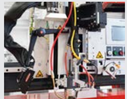
/ Weldhead with AVC/OSC slides, camera