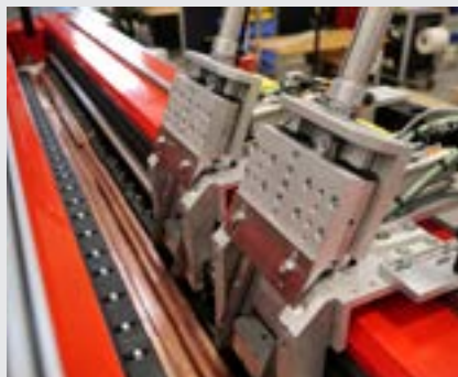
/ Adjustable pneumatic center stops