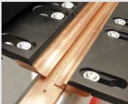
/ Backing track with forming gas holes